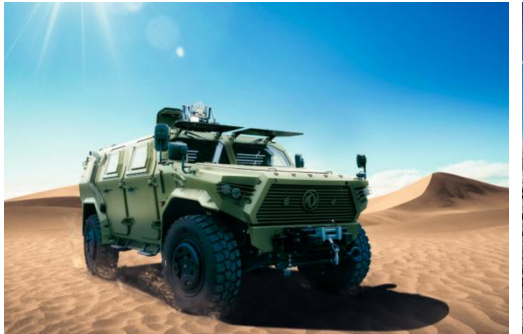
300 HP Series Rated power (HP/N·m) 300/850