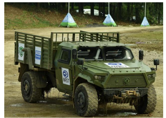
Laser interception vehicle