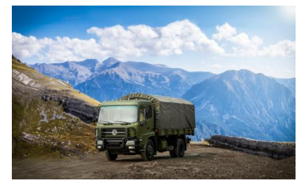
D530 Desert off-road personnel transport vehicle

D153 Desert off-road personnel transport vehicle