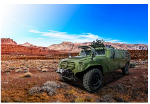
200HPSeriesRated power (HP/N·m)200/570