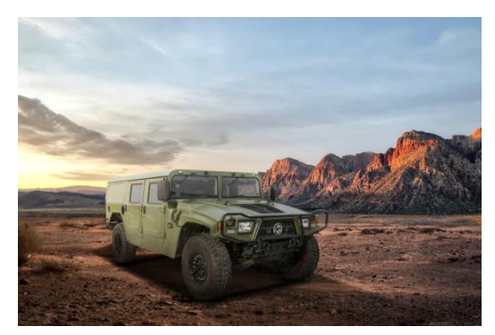
150 HP Series Rated power (HP/N·m) 150/502