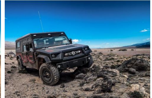
M50 Rated power (HP/N·m) 195/600