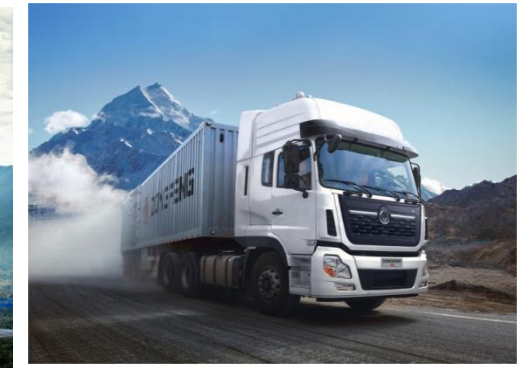
DONGFENG VL /09