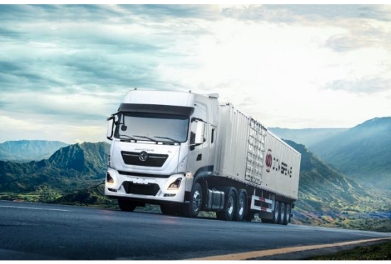
DONGFENG KL /07