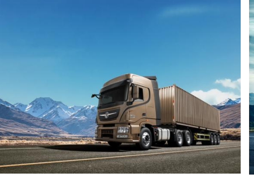
DONGFENG KX /05