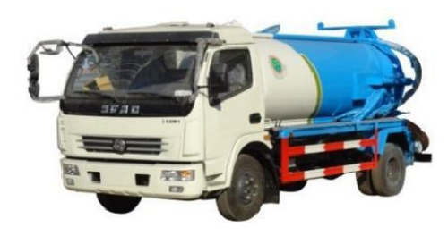
DONGFENG 3cbm sewage